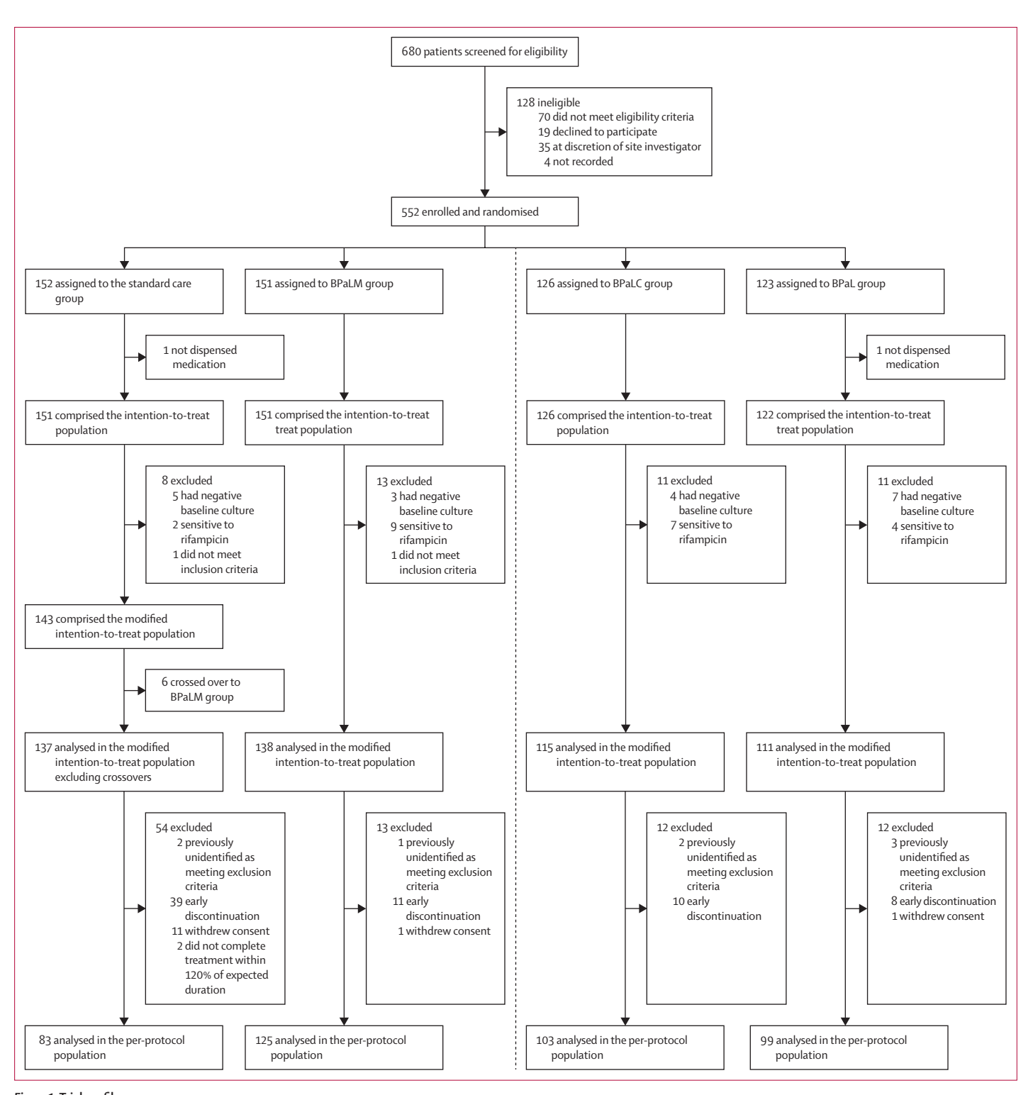
Figure 1: Trial profile

The groups to the left-hand side of the dashed line are the standard care and BPaLM groups, which were included in stage two of the study. To the right of the dashed line are the BPaLC and BPaL groups, which discontinued recruitment after transition to stage two. BPaL=bedaquiline, pretomanid, and linezolid. BPaLC=BPaL plus clofamizine. BPaLM=BPaL plus moxifloxacin.